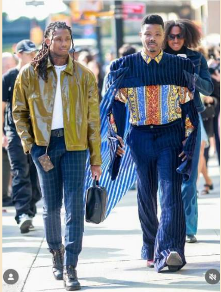
34K 251 Liked by creatively_tailored and others watchingnewyork Some NYFW shots from this week