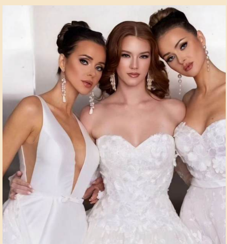
watchingnewyork CEO SPOTTED Manhattan, New York on Streets of NYC

We seek donors' support, products and services to advance Houston's entertainment scene, and incentivize youth with scholarships and talent development.